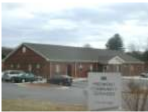
Piedmont Community Services Patrick County Office 22280 Jeb Stuart Hwy. Stuart, VA 24171 (276) 694-4361